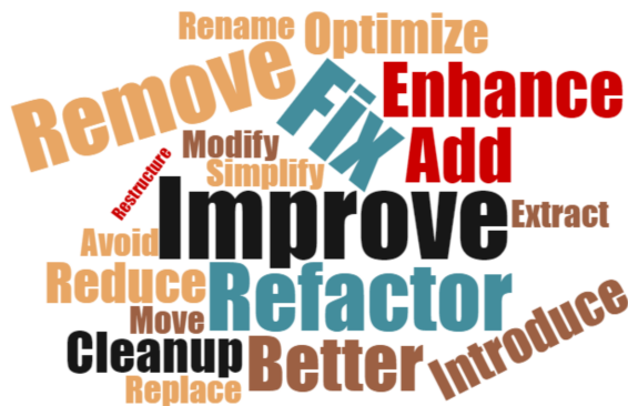
Figure 2: Top-10 Popular Patterns.

unit 7 , and (3) Moved data classes to a more suitable package , from Cdk 8 . A Closer inspection of these commit messages shows that developers intentionally apply refactoring to remove antipatterns that violate design principles and good programming practices.