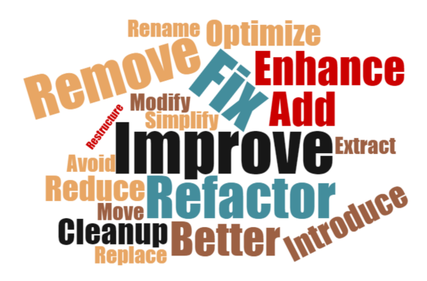
Figure 2: Top-10 Popular Patterns.

unit<sup>7</sup>, and (3) Moved data classes to a more suitable package , from Cdk<sup>8</sup>. A Closer inspection of these commit messages shows that developers intentionally apply refactoring to remove antipatterns that violate design principles and good programming practices.